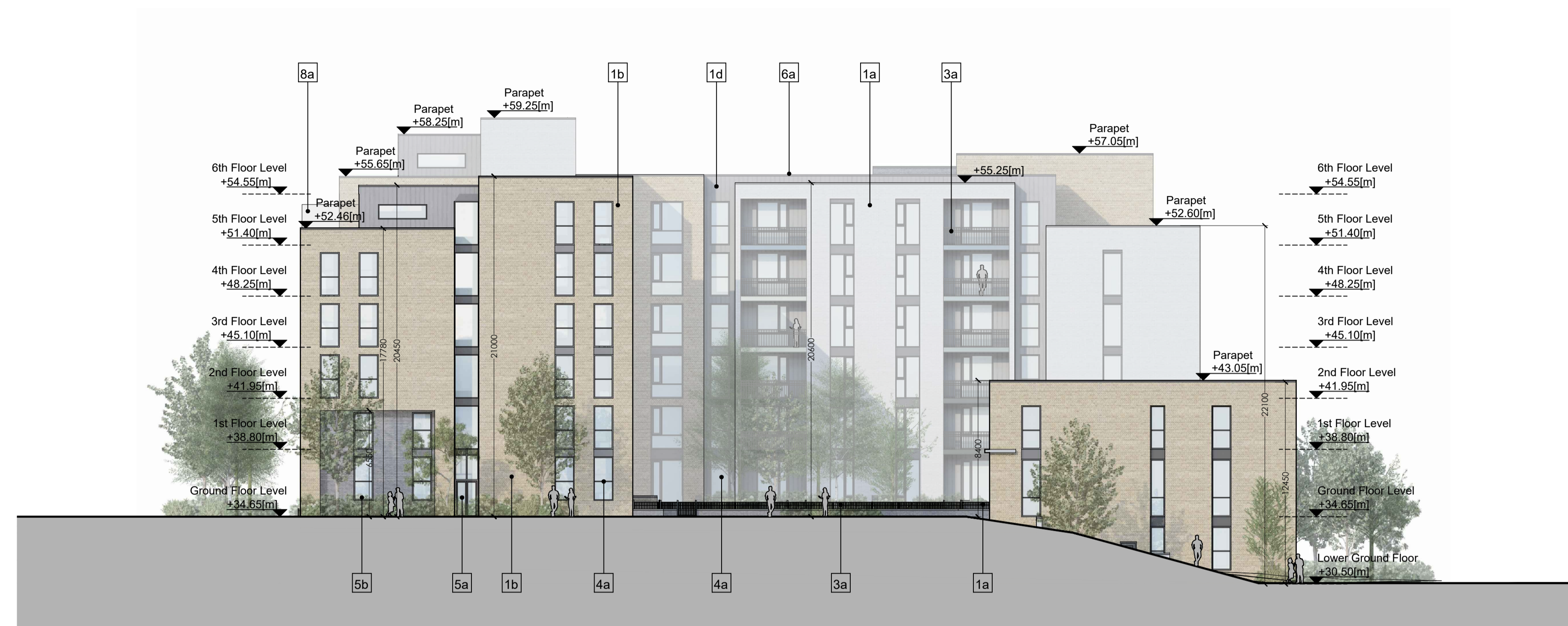
East Elevation - Block 5 Scale 1:200 @A1

Note: 1.8mm high glass balustrade can be provided on the upper level balconies if required by the Planning Authority.