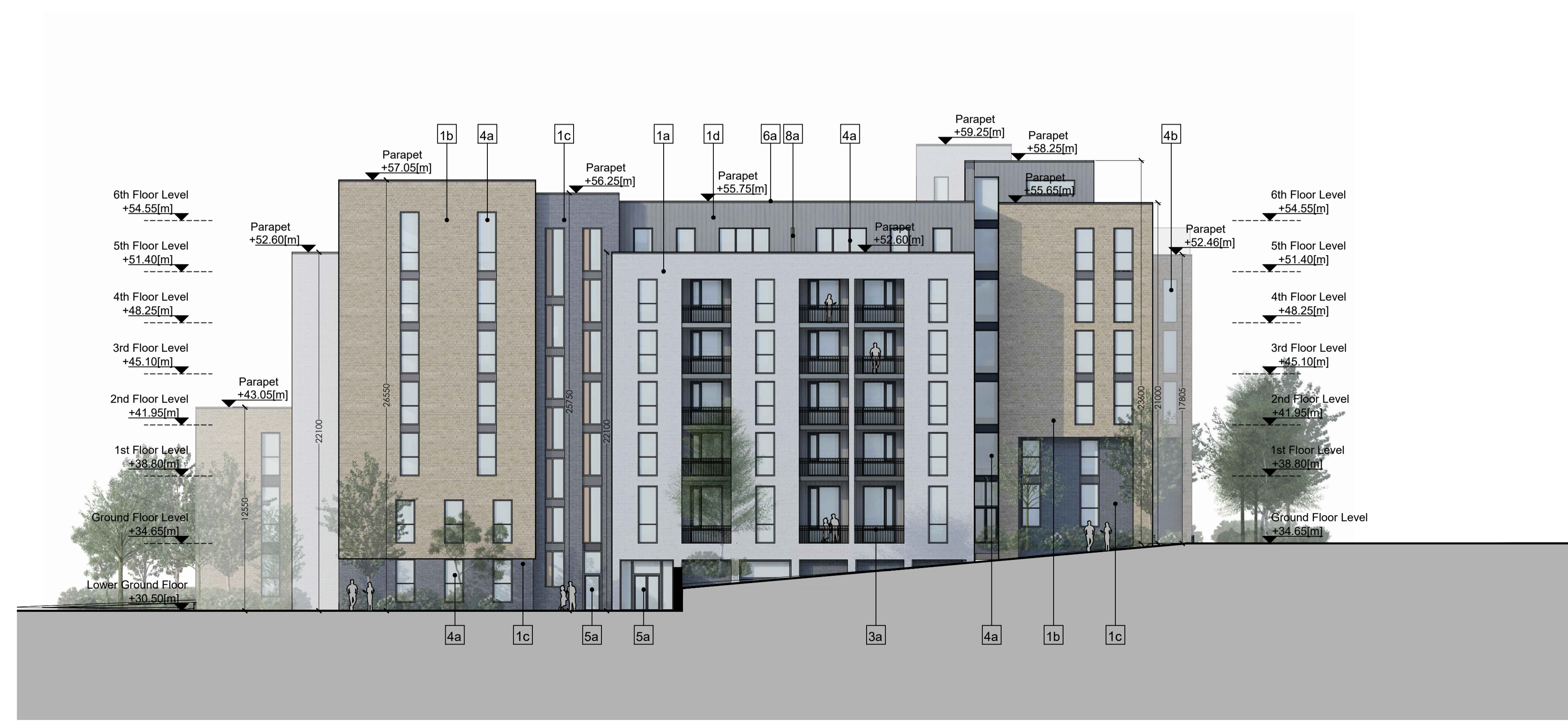
West Elevation - Block 5 Scale 1:200 @A1